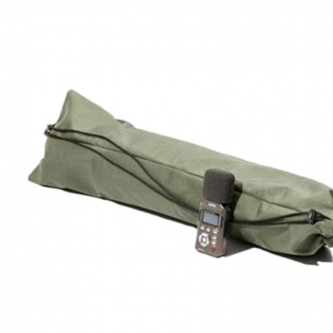
Photo: System packed with dish. Please note: Recorder pictured is not included.